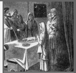
The First Passover

“Christ our Passover is sacrificed for us; therefore let us keep the feast, not with old leaven, neither with the leaven of malice and wickedness, but with the unleavened bread of sincerity and truth” 1 Cor. 5: 7, 8.