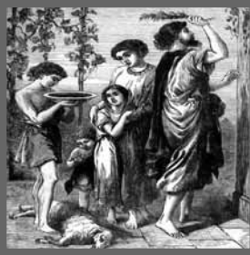
Applying the Blood